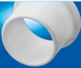
Moldflon® friction bearing