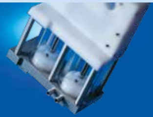
Double piston pump

Our technologically sophisticated solutions allow for optimal results with modern medical and laboratory technology. Application-specific and optimized components result in medical products with unique properties, thanks to the plastic PTFE. For the clinical user, we offer products with a high level of usability. Their use guarantees reliability and safety for patients and staff.