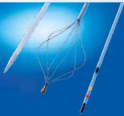
Color-coded PTFE tubings